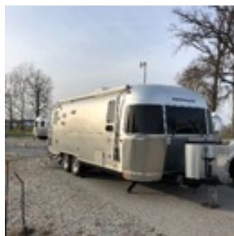
Chuck at Airstream