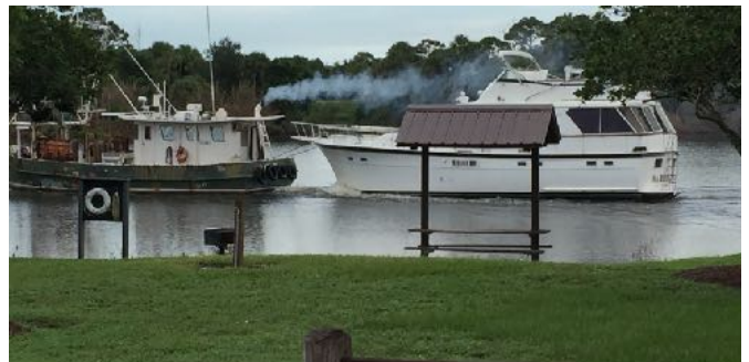
BOATS EXITING THE LOCK