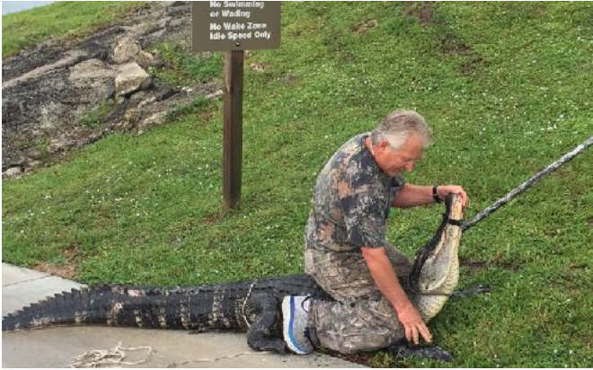
ALLIGATOR TRAPPER CAME TO RELOCATE THIS 10 FT GATOR AWAY FROM THE CAMPGROUND

Please if you are in the area stop by and say hello!