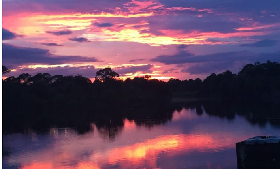
SUNSETS ARE BEAUTIFUL!